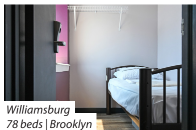
Williamsburg 78 beds | Brooklyn