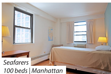
Seafarers 100 beds | Manhattan

During the worst days of COVID-19, Breaking Ground worked with New York City to quickly open two new transitional housing sites for unsheltered New Yorkers in Williamsburg, Brooklyn and Union Square in Manhattan. Locating these programs near where people are experiencing homelessness was a recipe for success. At the beginning of 2022, we worked with the City again to convert them to safe havens, providing additional onsite services for the most vulnerable street homeless New Yorkers while we work with each person toward permanent housing. Williamsburg and Seafarers increased our transitional housing capacity by 58%.