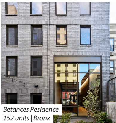
Betances Residence 152 units | Bronx

Our first hotel conversion in more than two decades, 90 Sands demonstrates the promise of adapting existing buildings to help solve our affordable housing and homelessness crisis. It is also the site of a new pilot program that aims to reduce the time it takes for people to go from homeless to housed . That's impact.