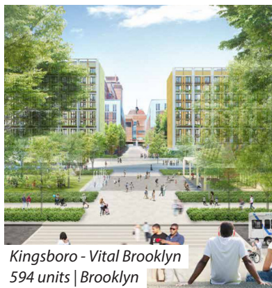
Kingsboro - Vital Brooklyn 594 units | Brooklyn

A collaboration with Community Healthcare Network, our Jamaica residence will bring a state-of-the-art medical clinic along with 173 units of supportive and affordable housing for older adults who have experienced or are at risk of homelessness. Set to break ground in 2023, Jamaica Residence will welcome its first residents in 2025.