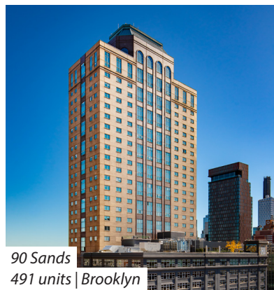
90 Sands 491 units | Brooklyn

Our first hotel conversion in more than two decades, 90 Sands demonstrates the promise of adapting existing buildings to help solve our affordable housing and homelessness crisis. It is also the site of a new pilot program that aims to reduce the time it takes for people to go from homeless to housed . That's impact.