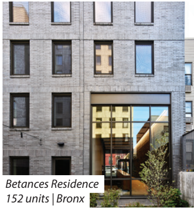
Betances Residence 152 units | Bronx

Our first hotel conversion in more than two decades, 90 Sands demonstrates the promise of adapting existing buildings to help solve our affordable housing and homelessness crisis. It is also the site of a new pilot program that aims to reduce the time it takes for people to go from homeless to housed . That's impact.