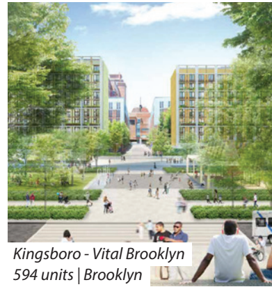
Kingsboro - Vital Brooklyn 594 units | Brooklyn

A collaboration with Community Healthcare Network, our Jamaica residence will bring a state-of-the-art medical clinic along with 173 units of supportive and affordable housing for older adults who have experienced or are at risk of homelessness. Set to break ground in 2023, Jamaica Residence will welcome its first residents in 2025.