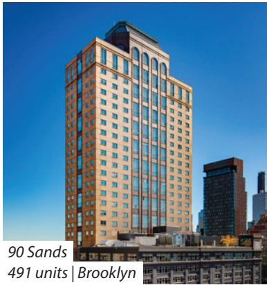
90 Sands 491 units | Brooklyn

Our first hotel conversion in more than two decades, 90 Sands demonstrates the promise of adapting existing buildings to help solve our affordable housing and homelessness crisis. It is also the site of a new pilot program that aims to reduce the time it takes for people to go from homeless to housed . That's impact.