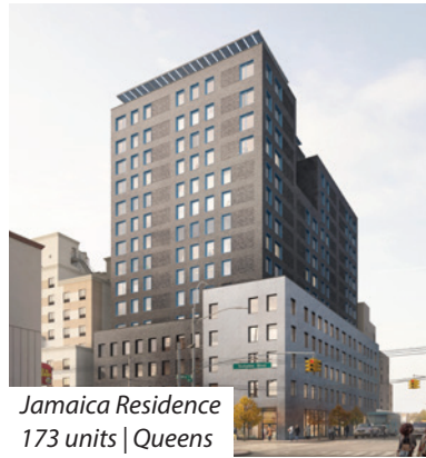
Jamaica Residence 173 units | Queens

A collaboration with Community Healthcare Network, our Jamaica residence will bring a state-of-the-art medical clinic along with 173 units of supportive and affordable housing for older adults who have experienced or are at risk of homelessness. Set to break ground in 2023, Jamaica Residence will welcome its first residents in 2025.