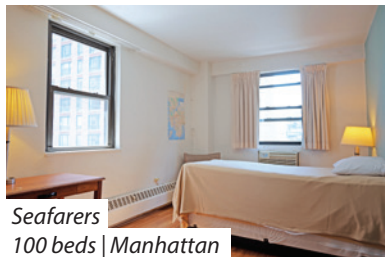
Seafarers 100 beds | Manhattan

During the worst days of COVID-19, Breaking Ground worked with New York City to quickly open two new transitional housing sites for unsheltered New Yorkers in Williamsburg, Brooklyn and Union Square in Manhattan. Locating these programs near where people are experiencing homelessness was a recipe for success. At the beginning of 2022, we worked with the City again to convert them to safe havens, providing additional onsite services for the most vulnerable street homeless New Yorkers while we work with each person toward permanent housing. Williamsburg and Seafarers increased our transitional housing capacity by 58%.