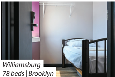
Williamsburg 78 beds | Brooklyn