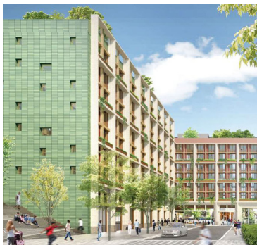
In 2021, a team led by Breaking Ground and Douglaston Development were selected to redevelop a portion of the Kingsboro Psychiatric Center in East Flatbush, Brooklyn. The project will create more than 900 units of much-needed supportive and affordable housing, along with programming for formerly incarcerated individuals, job training, child care, and a new supermarket.

In addition, Breaking Ground has over 1,200 supportive and affordable apartments in development, including projects in the Bronx, Brooklyn, and Queens.