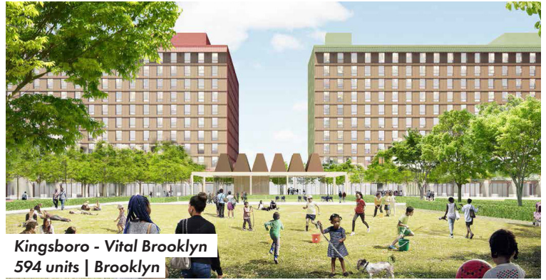
Kingsboro - Vital Brooklyn 594 units | Brooklyn

This Vital Brooklyn project, in collaboration with Douglaston Development and Empire State Development, will bring over 900 affordable and supportive apartments to Brooklyn's Flatbush neighborhood, new state-of-the-art transitional housing to replace 356 existing shelter beds, extensive public amenities including a new park and recreation facility, new retail and community facility spaces, and programming with and for community members and residents. We expect construction on the project to begin in 2025, with completion in three phases expected by 2029.