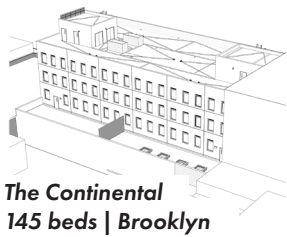
The Continental 145 beds | Brooklyn

Breaking Ground was proud to work with New York City and Manhattan Community Board 7 to open a new safe haven on the Upper West Side in 2023, now among just a handful of sites for unsheltered New Yorkers above 59th Street. The first 76 beds opened in August of 2023, with an additional 32 to open in 2024. We are also excited to make progress at a newly constructed safe haven in Greenpoint, Brooklyn. Under construction since 2021, it will bring 145 more much-needed safe have beds to North Brooklyn in the second quarter of 2024. These two sites together will expand our safe haven capacity by nearly 58%.