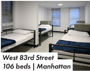
West 83rd Street 106 beds | Manhattan