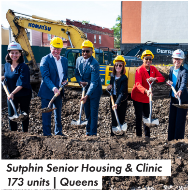
Sutphin Senior Housing & Clinic 173 units | Queens