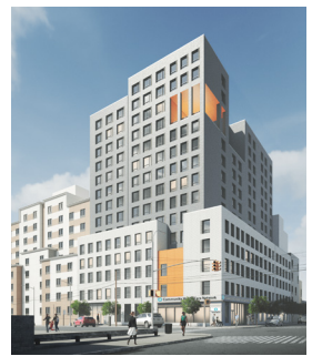
Jamaica Senior Residence Queens | 173 Units In Pre-Development