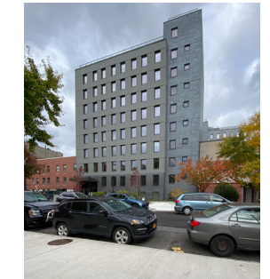
Betances Senior Residence Bronx | 152 Units Opening 2022

With over 1,400 units of permanent housing in development, Breaking Ground is leading the way in creating new apartments with onsite supportive services to help people overcome and avoid homelessness.