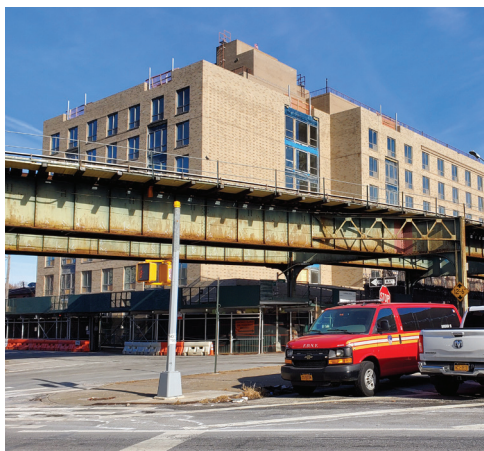
Edwin's Place (Brownsville, Brooklyn) 125 Units | Opening Summer 2020

SUPPORTIVE & AFFORDABLE HOUSING SOLVES HOMELESSNESS | OUR DEVELOPMENT PIPELINE INCLUDES: