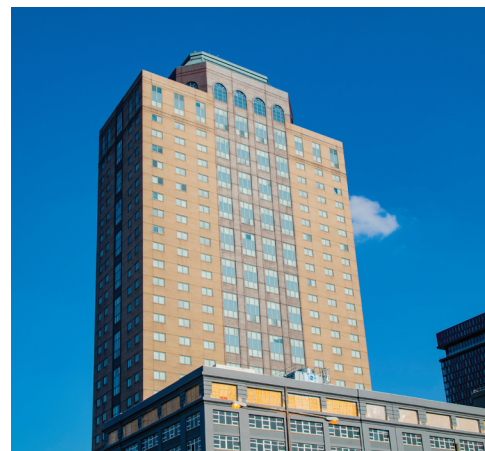
90 Sands Street (DUMBO, Brooklyn) 508 Units | Opening 2021

HELPING VULNERABLE NEW YORKERS OVERCOME AND AVOID HOMELESSNESS SINCE 1990, BECAUSE EVERYONE DESERVES A HOME