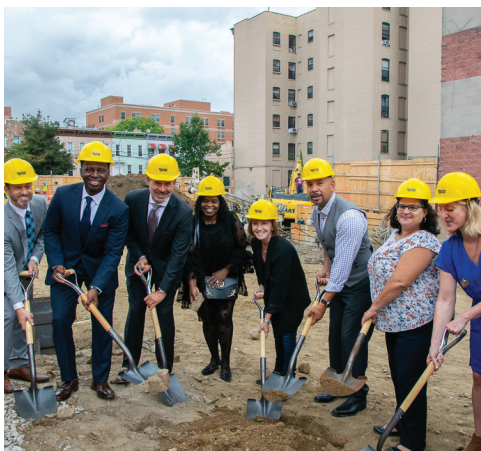
Betances Senior Residence (South Bronx) 152 Units | Opening Summer 2021